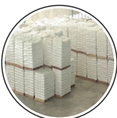
COLD STORAGE SACKS