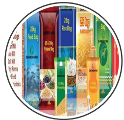
BOPP SACKS AND BAGS