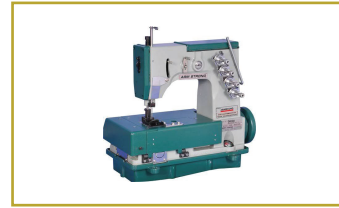
Stitching Machine (Gabbar)