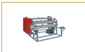
Splitting & Gazetting Machine