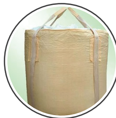
FERRO ALLOY SACKS