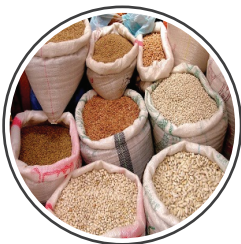
FOOD GRAINS SACK