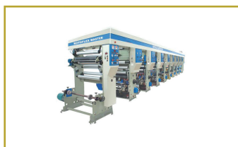
Roto Gravure (Digital Printing)