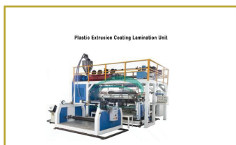
Extrusion and laminating Machine