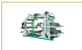
Online Flexo printing, Roll to Roll