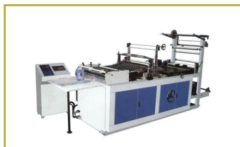
Cutting machine (Automatic)