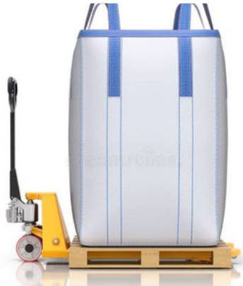
JUMBO/ FIBC BAG

Our product is used for packaging various things such as rice, wheat, Pulses, sugar, courier, salt, and sand and cement bags. based on client requirement we offer multi color printed, laminated/unlaminated, uvstabilized PP woven bags with custom size.