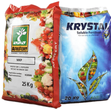
DIGITAL / BOPP WOVEN SACKS