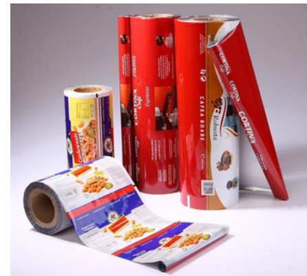
LD FILMS/ POUCHES