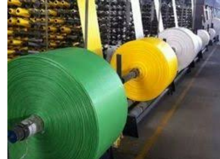
PP WOVEN ROLLS