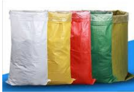
PP WOVEN SACKS