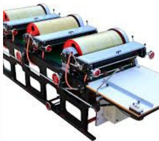
MANUAL PRINTING MACHINE