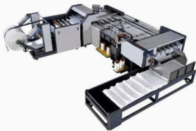
ONLINE BCS MACHINE AUTOMATIC FINISHING