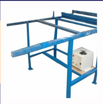
MANUAL HAND CUT MACHINE