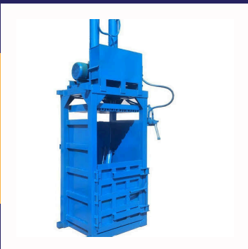
BAIL PRESS MACHINE FOR PACKING